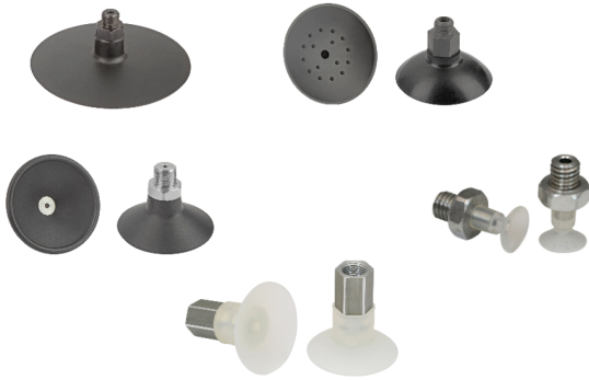
Flat Suction Cups SGN